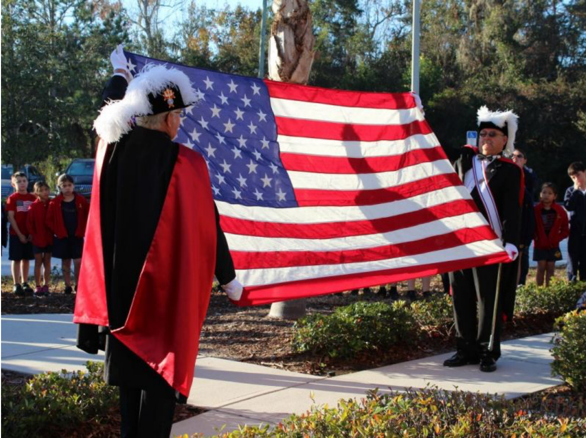
4 TH Degree Honor Guard

The traditional method of folding the flag is as follows: